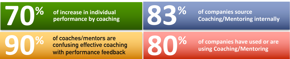
Source: LIM commissioned independent research at 250 large organizations.

Business Coaching is keeping its inclining trend among millions of managers throughout the globe. Yet very productive and successful, it can be expensive to use for lower levels in the organization and sometimes inhouse mentoring is needed as well. Would you like to add this valuable skill to your company and enhance employee sustainability?